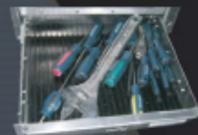
Dimensions of drawers available